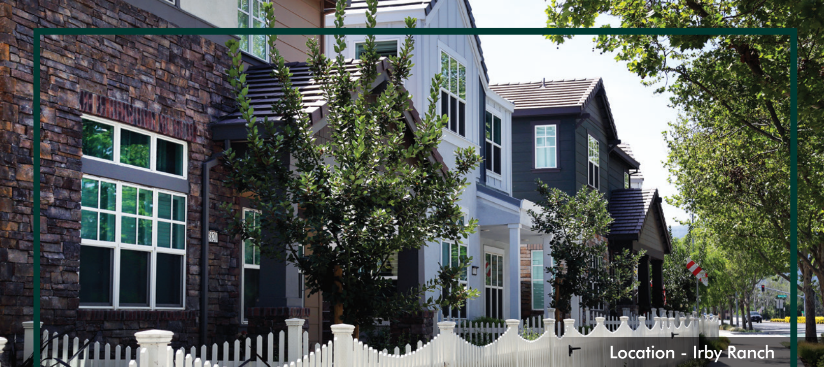
Location - Irby Ranch