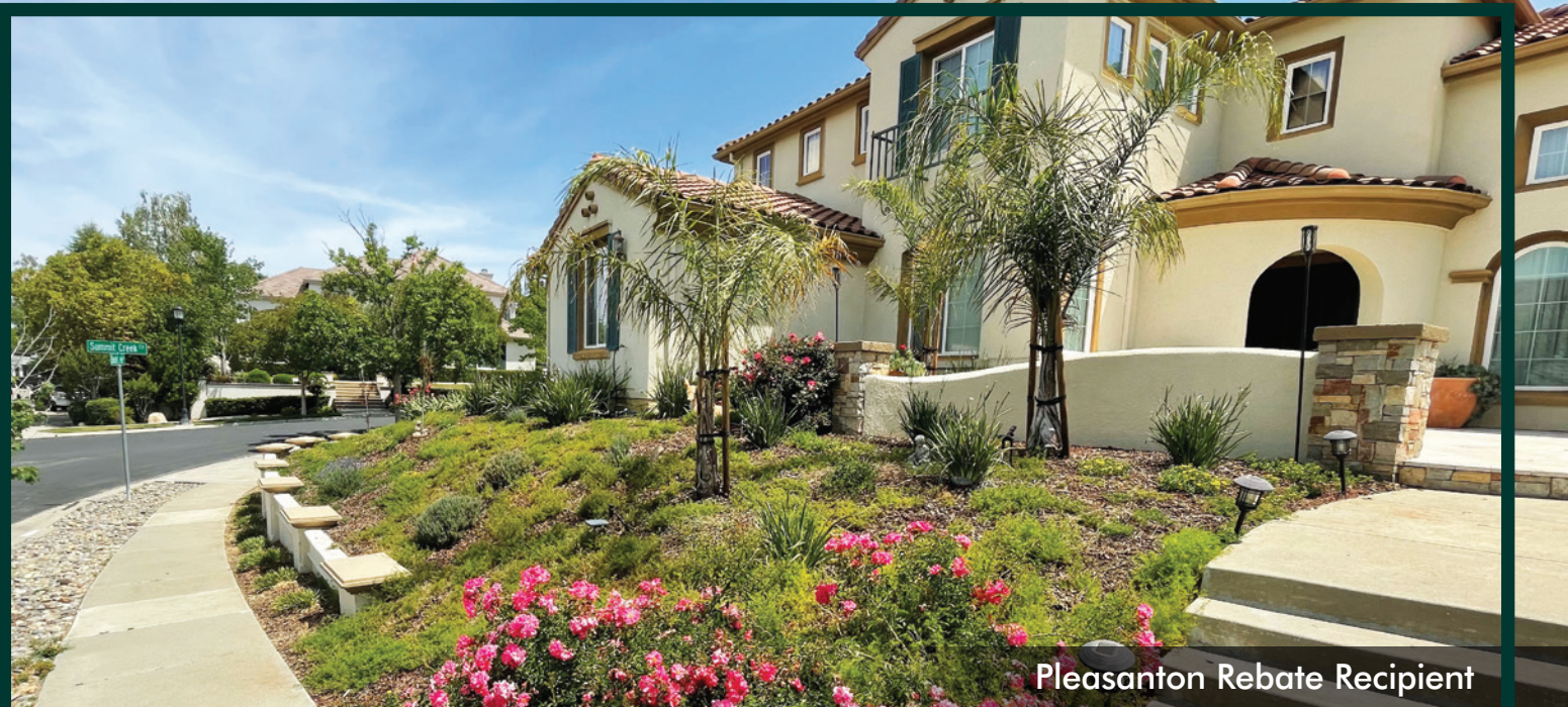
Pleasanton Rebate Recipient