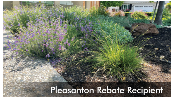
Pleasanton Rebate Recipient

Between the rebates offered by Zone 7 and the City of Pleasanton, customers can receive up to $2,575 (Residential) or $10,000 (Commercial/Irrigation) by participating in both programs. There are no retroactive rebates. All projects must be approved and provided a Notice to Proceed from the City of Pleasanton prior to removal of the lawn to be converted.