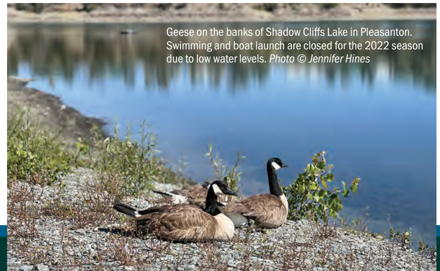
Geese on the banks of Shadow Cliffs Lake in Pleasanton. Swimming and boat launch are closed for the 2022 season due to low water levels.

The disinfectant, Chloramine (a combination of chlorine and ammonia), is used to disinfect both Zone 7 and the City's water. This disinfectant is utilized to protect public health by destroying disease-causing organisms that may be present in water supplies. Chloramines, at the low levels used, will not cause any health problems for the general public. However, aquarium owners and home dialysis patients must take special precautions before chloraminated water can be used in aquariums or home kidney dialysis machines, due to the very small amount of ammonia present in the water.