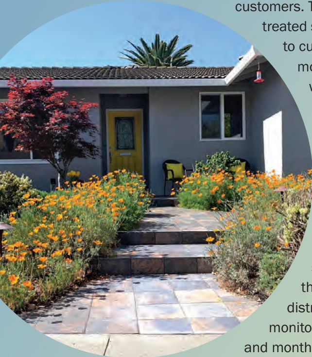
Vigorous, drought-tolerant California poppies thrive in Pleasanton yards.

If you have questions regarding the quality of the water supplied to you by the City, this report should provide most of the answers. We appreciate the time you take to read this report and welcome any additional questions or comments you may have regarding your water supply. For further information on Pleasanton's water quality or water supplies, call the City's Water Quality Lab at 925-931-5510, or email your questions to us at osd@cityofpleasantonca.gov .