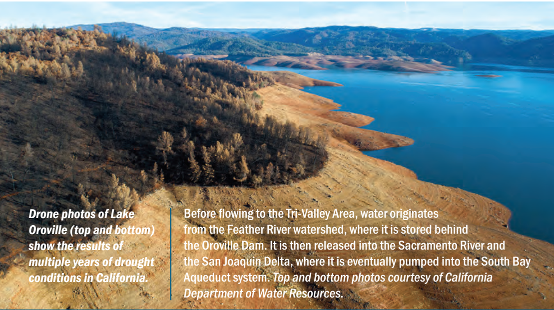
Drone photos of Lake Oroville (top and bottom) show the results of multiple years of drought conditions in California.

Before flowing to the Tri-Valley Area, water originates from the Feather River watershed, where it is stored behind the Oroville Dam. It is then released into the Sacramento River and the San Joaquin Delta, where it is eventually pumped into the South Bay Aqueduct system.