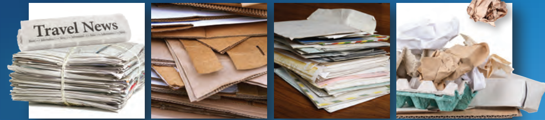
clean dry paper: newspaper, office paper, magazines, mail, cardboard, paperboard boxes