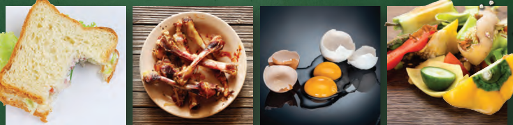
bones, meat scraps, dairy, rinds, peels, egg shells, pasta, breads, grains, fruits & vegetables