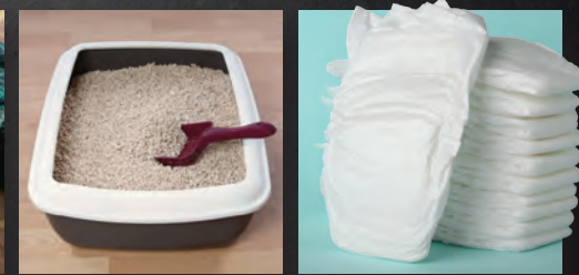
cat litter, pet waste, diapers, feminine products, tissue paper