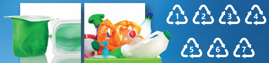
plastic tubs, narrow-neck plastic bottles & jugs RIC codes 1-7, look for these icons on your plastics