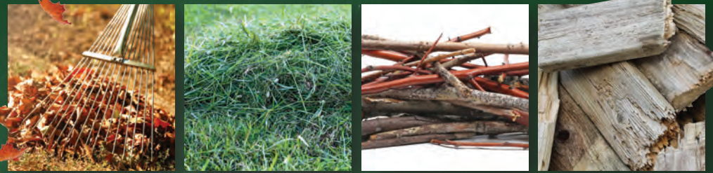
leaves, grass clippings, branches under 6" in diameter & untreated wood