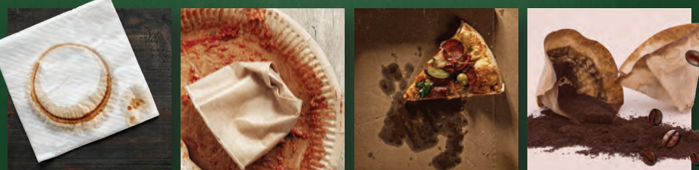
paper towels & napkins, uncoated paper plates & cups, pizza boxes, tea bags, coffee filters & grounds