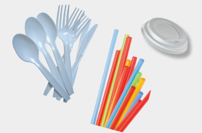
Plastic Utensils, Lids, Cups and Straws