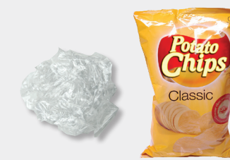
Plastic Bags and Wraps