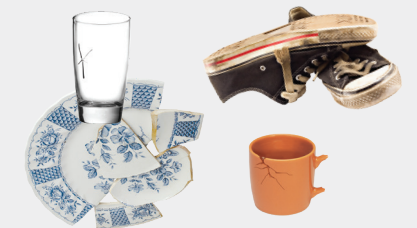
Miscellaneous Household Waste