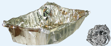
Aluminum Foil and Pans