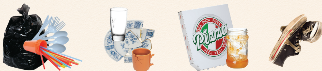
Plastic Bags & Utensils