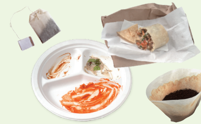
Food Soiled Paper

Uncoated paper plates & cups, pizza boxes, tea bags, coffee filters & grounds. No plastic-lined paper products.