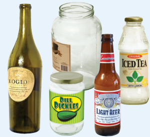
Empty Glass Bottles and Jars