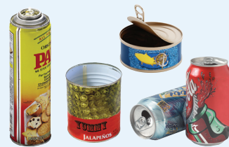
Empty Aerosol and Metal Cans