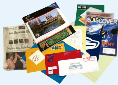
Clean Dry Paper