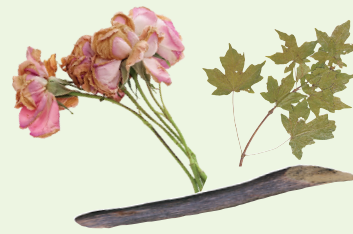
Plant Debris, Flowers and Untreated Wood

Uncoated paper plates & cups, pizza boxes, tea bags, coffee filters & grounds. No plastic-lined paper products.