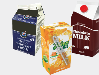
Drink Cartons and Beverage Boxes