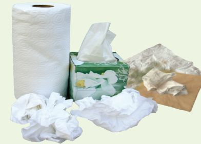
Paper Napkins and Paper Towels

Leaves, grass clippings, branches under 6" in diameter & untreated wood