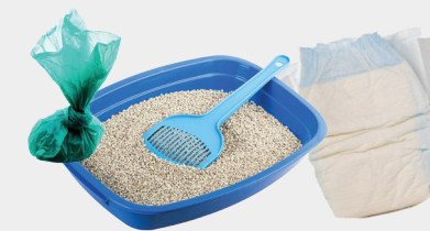
Diapers and Pet Waste