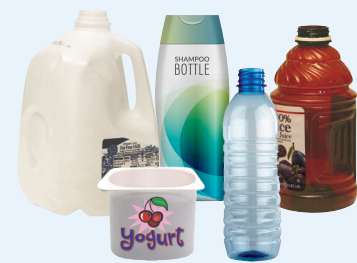
Empty Plastic Bottles and Containers